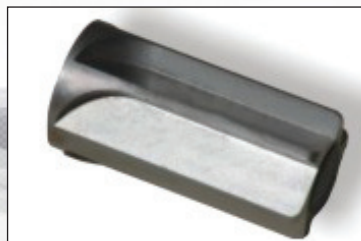
Six Flute Tool (Optional)