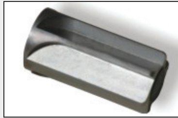
Item 37571 Six Flute Tool (Optional)

Can be supplied in place of the diamond tooth on a new machine for an additional charge or as an accessory. Used mainly on large scale fish with thick skin. Some examples include Carp, Buffalo, and Grouper.